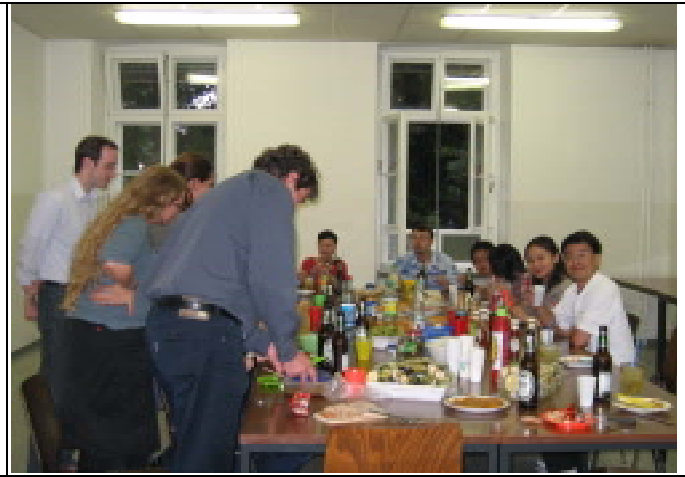
Personnel interaction in Marburg University