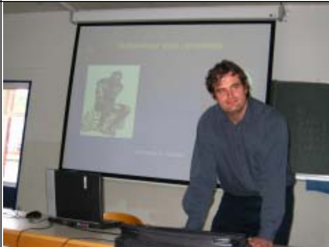
Scientific presentation in Marburg University